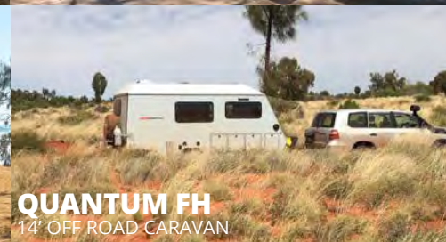
QUANTUM FH 14' OFF ROAD CARAVAN