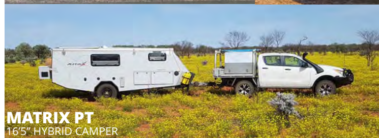
MATRIX PT 16'5" HYBRID CAMPER