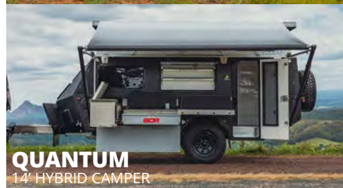
QUANTUM 14' HYBRID CAMPER