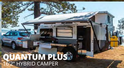
QUANTUM PLUS 16'2" HYBRID CAMPER