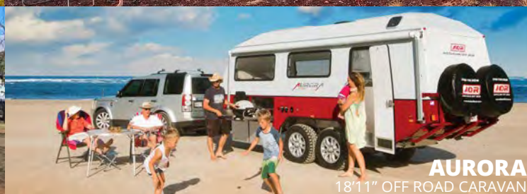
AURORA 18'11" OFF ROAD CARAVAN