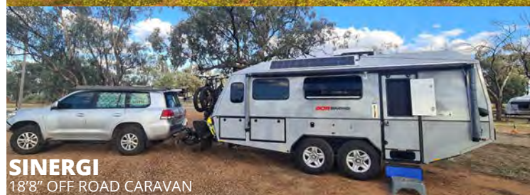
SINERGI 18'8" OFF ROAD CARAVAN