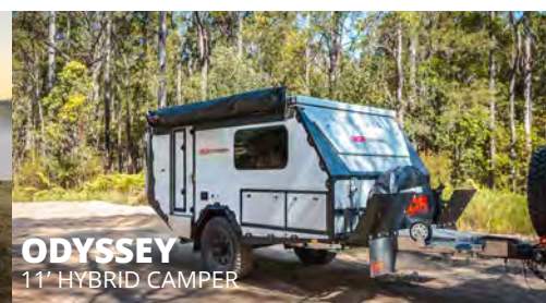
ODYSSEY 11' HYBRID CAMPER