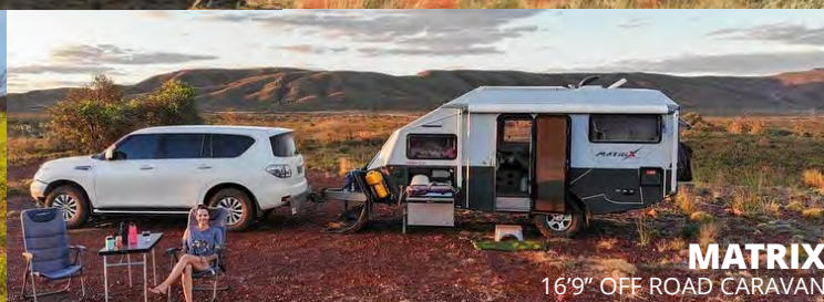
MATRIX 16'9" OFF ROAD CARAVAN