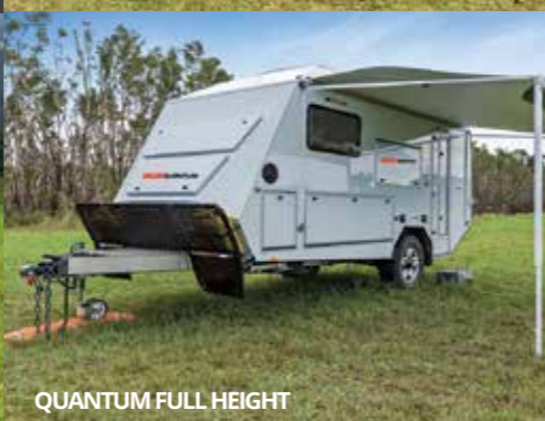
QUANTUM FULL HEIGHT