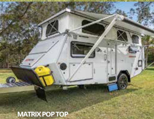
MATRIX POP TOP